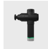
Hypervolt 2 Pro