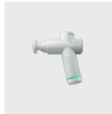
Hypervolt Go 2

EMAIL SEAN ( sean@ligoniercountryclub.com ) to order